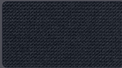
055 - darkblue