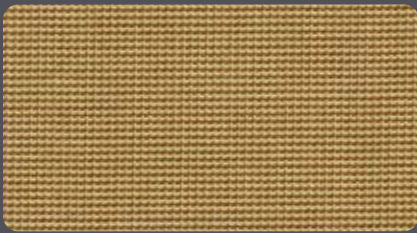
000 - gold