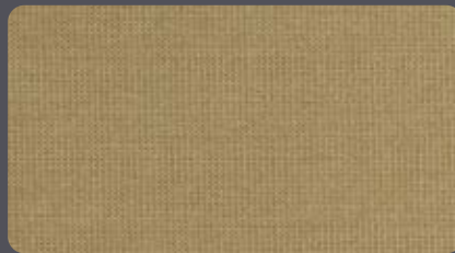
101 - gold