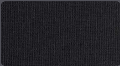
059 - darkblue